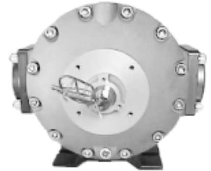
TS20ASHE Representative Model

FPP Meters' versatile STEALTH Series is available in a variety of configurations including mechanical registration, electronic registration or non-factored pulse output flow sensors. With only two moving parts and exceptional pressure loss characteristics, STEALTH represents the ideal platform for year 2000 metering systems.